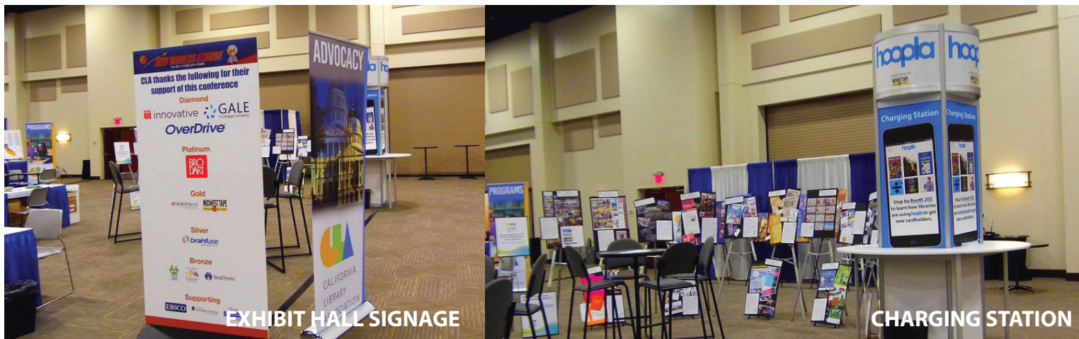
EXHIBIT HALL SIGNAGE