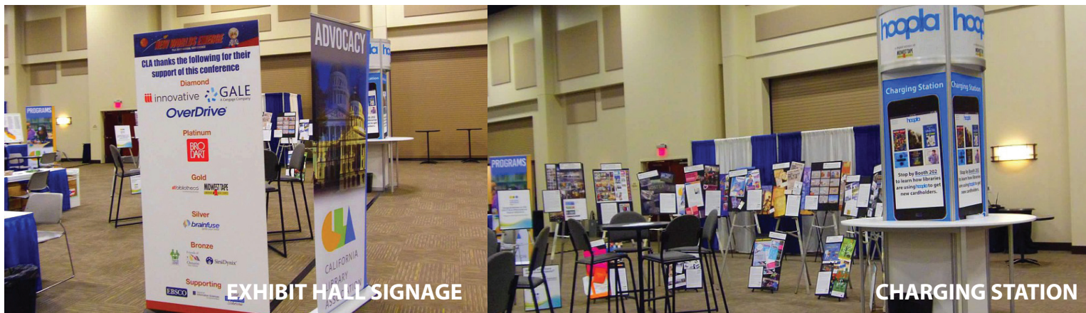
EXHIBIT HALL SIGNAGE